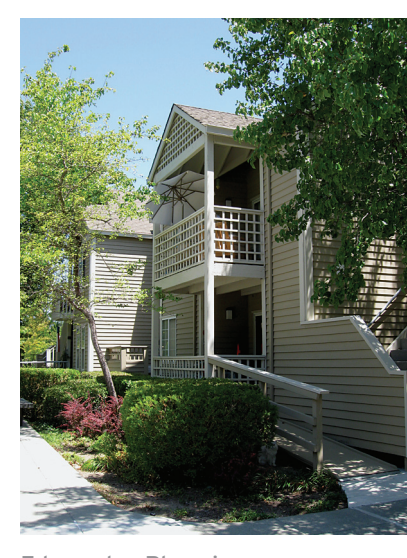
Edgewater Place in Larkspur provides affordable apartments for families, but has long waiting lists.

For Marin workers seeking an affordable rental option costing less than $1,500 per month, the discrepancy between supply and need totals more than 25,000 homes. This is not to suggest that Marin should aim to build 25,000 affordable homes next year. But this does shed light on the scale of the problem, and the limited choices available to Marin employees earning less than $54,000 per year.